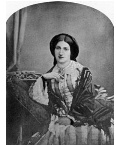
Mrs Beeton. The world's first female commuter?