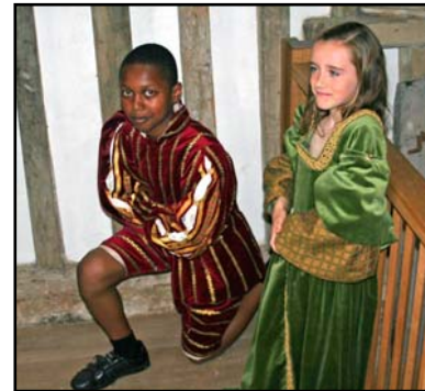
Dress up and visit the Manor!

Headstone Manor is the perfect site to extend your pupils historical knowledge beyond 1066. We offer this learning pack to support focused work using our scheduled ancient monument. The major changes in Harrows history can be explored through this unit of work, and there are links to national history.